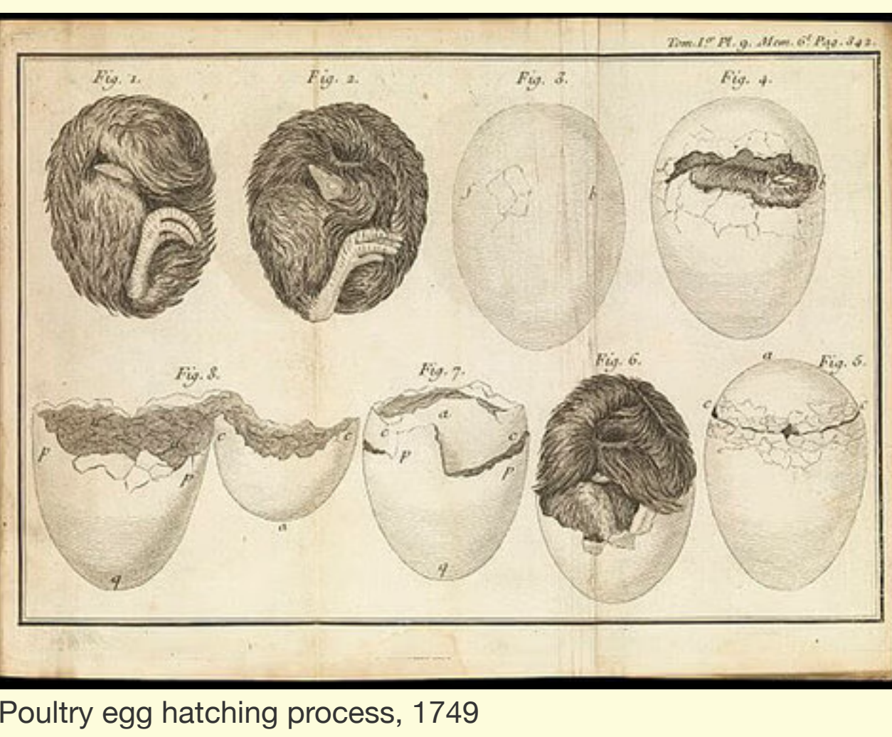
Poultry egg hatching process, 1749

My father was, I am sure, intended by nature to be a cheerful, kindly man. Until he was thirty-four years old he worked as a farm-hand for a man named Thomas Butterworth whose place lay near the town of Bidwell, Ohio. He had then a horse of his own and on Saturday evenings drove into town to spend a few hours in social intercourse with other farm-hands. In town he drank several glasses of beer and stood about in Ben Head's saloon--crowded on Saturday evenings with visiting farm-hands. Songs were sung and glasses thumped on the bar. At ten o'clock father drove home along a lonely country road, made his horse comfortable for the night and himself went to bed, quite happy in his position in life. He had at that time no notion of trying to rise in the world.